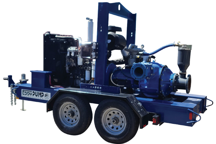
*Typical Deployment Photo. Dredge pumps can be deployed vertically or horizontally. Photos for general guidance. Contact us for further details.