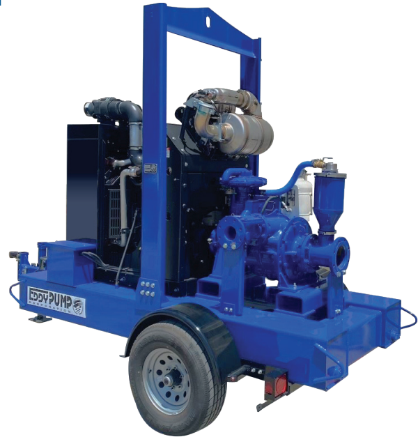
*Typical Deployment Photo. Dredge pumps can be deployed vertically or horizontally. Photos for general guidance. Contact us for further details.