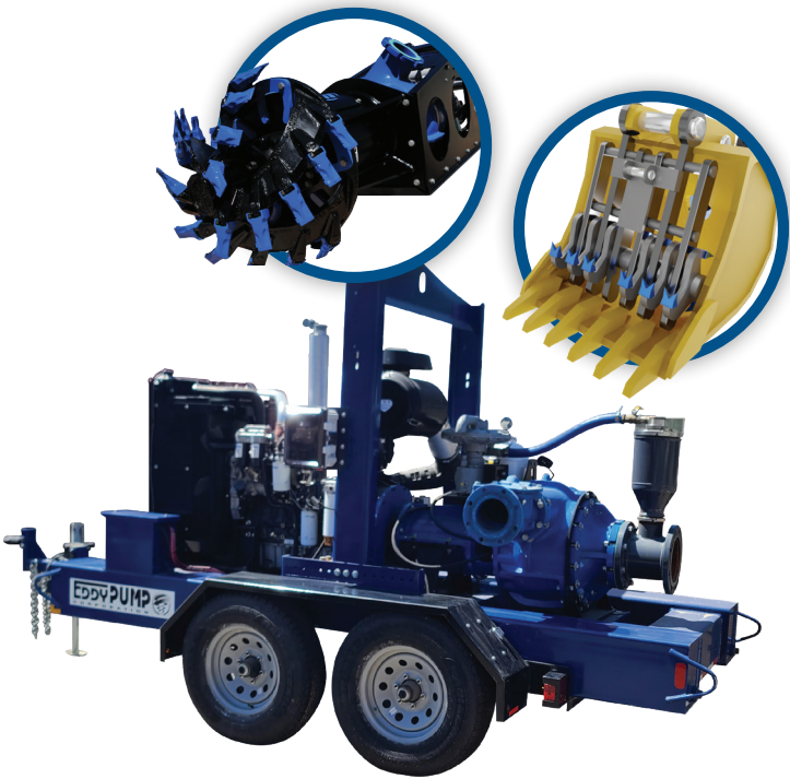
*Typical Deployment Photo. Dredge pumps can be deployed vertically or horizontally. Photos for general guidance. Contact us for further details.