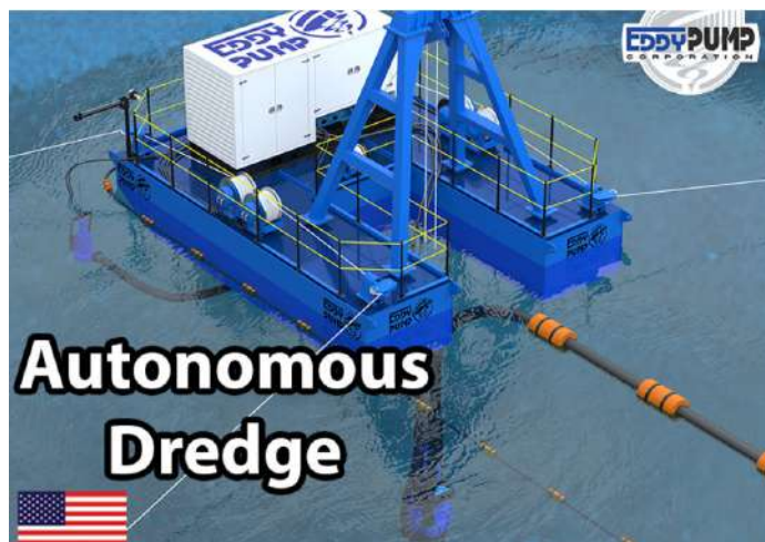
*Typical Attachment Photo. Photos For General Guidance. Contact Us For Further Details.