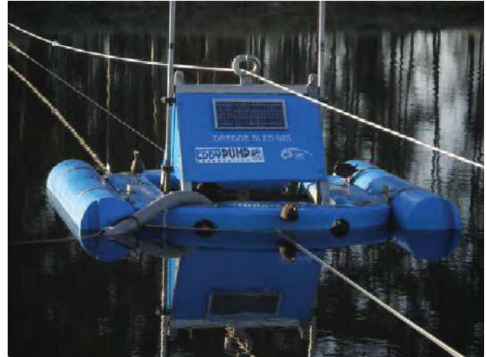
*Typical Attachment Photo. Photos for general guidance. Contact us for further details.