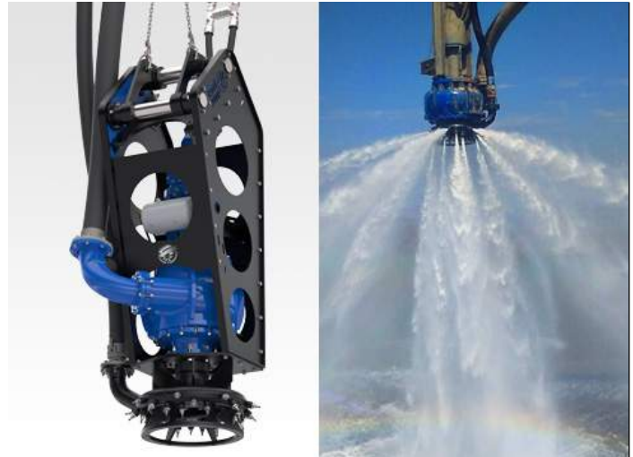
*For illustration purposes hydraulic and electric powered units are featured.