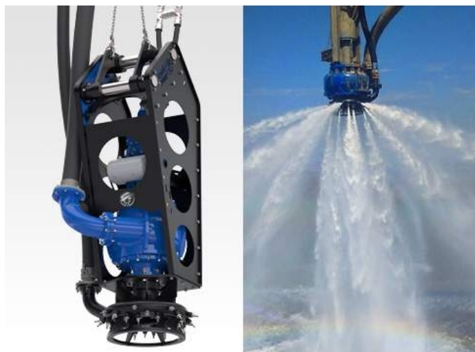
*For illustration purposes hydraulic and electric powered units are featured.