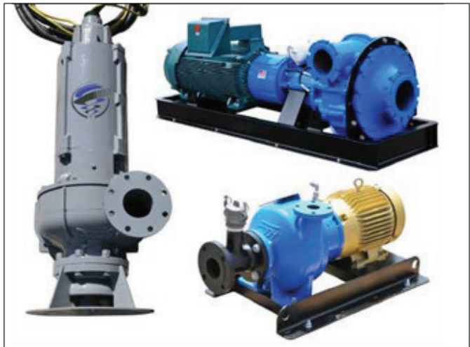
*Typical Deployment Photo. Dredge pumps can be deployed vertically or horizontally. Photos for general guidance. Contact us for further details.