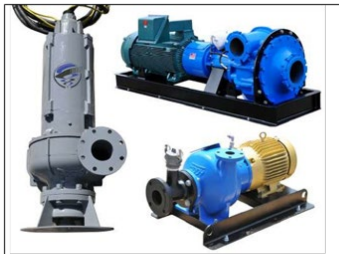
*Typical Deployment Photo. Dredge pumps can be deployed vertically or horizontally. Photos for general guidance. Contact us for further details.