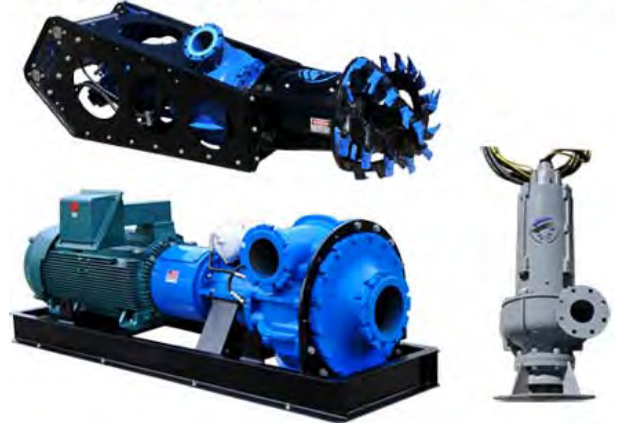
Typical Eddy Pumps. Process pumps and dredge pumps can be deployed vertically or horizontally. Contact us for further details. Photos for general guidance.