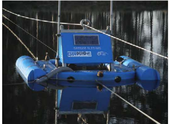
*Typical Attachment Photo. Photos for general guidance. Contact us for further details.