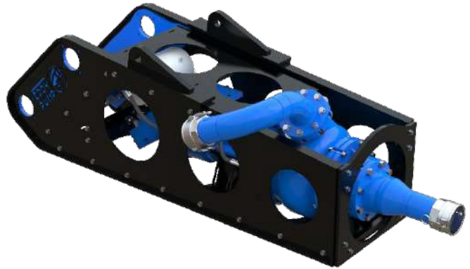
*Typical Attachment Photo. Photos for general guidance. Contact us for further details.