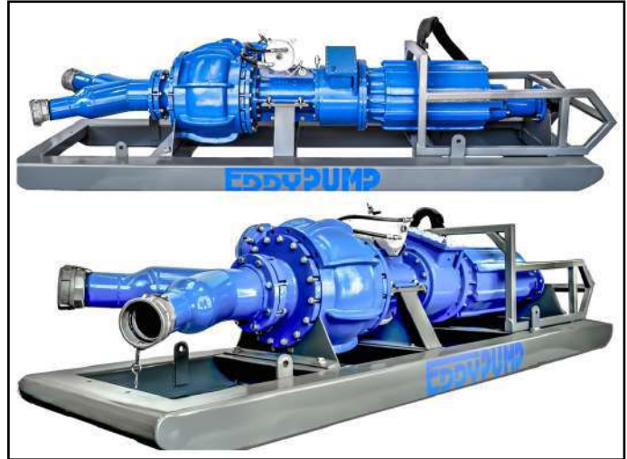
*Typical Deployment Photo. Photos for general guidance. Contact us for further details.