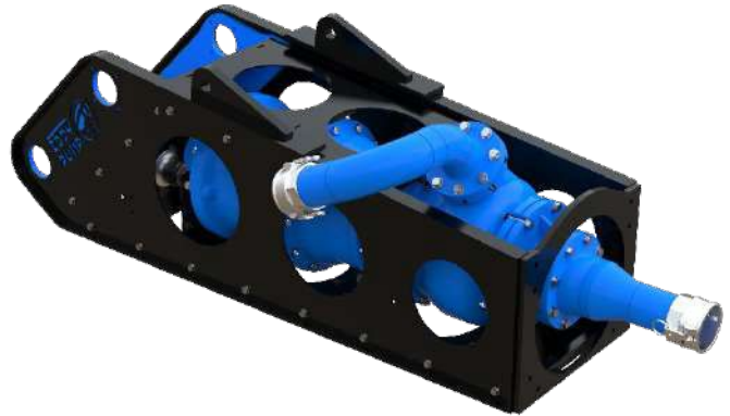
*Typical Attachment Photo. Photos for general guidance. Contact us for further details.