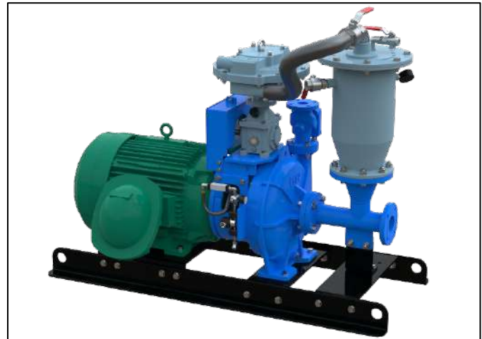
*Typical Deployment Photo. Dredge pumps can be deployed vertically or horizontally. Photos for general guidance. Contact us for further details.