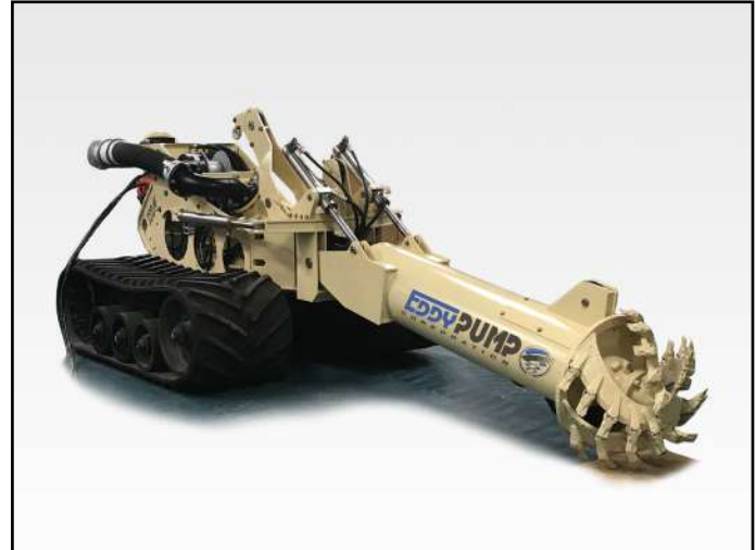
*Typical Subdredge Photo. Photos for general guidance. Contact us for further details.