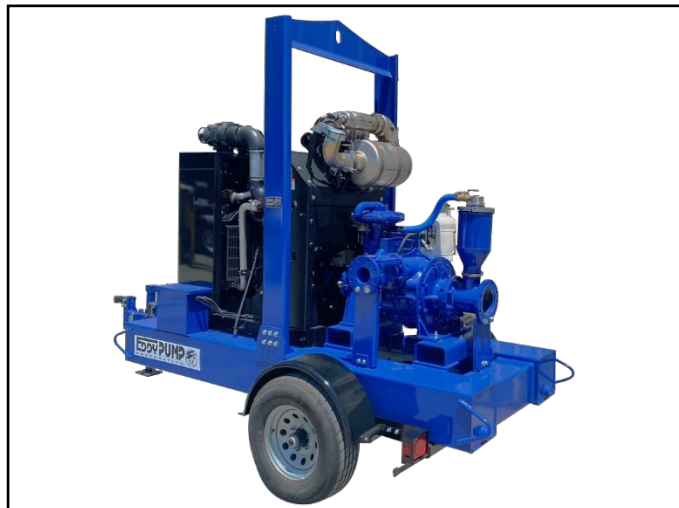
*Typical Deployment Photo. Dredge pumps can be deployed vertically or horizontally. Photos for general guidance. Contact us for further details.