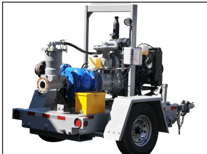
*Typical Deployment Photo. Dredge pumps can be deployed vertically or horizontally. Photos for general guidance. Contact us for further details.