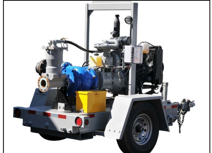
*Typical Self Prime trailer unit. Can be skid mounted also. Photos for general guidance. Contact us for further details.