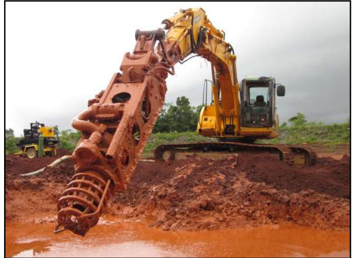
*Typical Attachment Photo. Photos for general guidance. Contact us for further details.