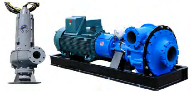
Typical Eddy Pumps. Contact us further details. Photo for general guidance.